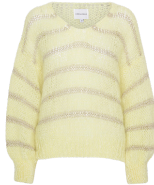
Light Yellow W/ Light Yellow Lurex