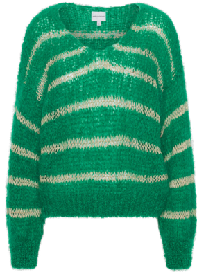
Emerald Green W/Gold