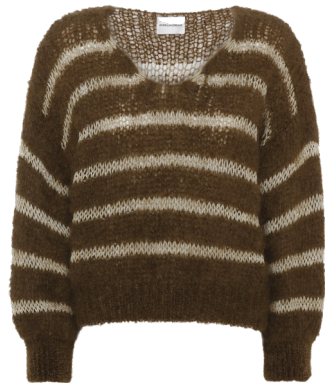
Dark Brown W/Gold