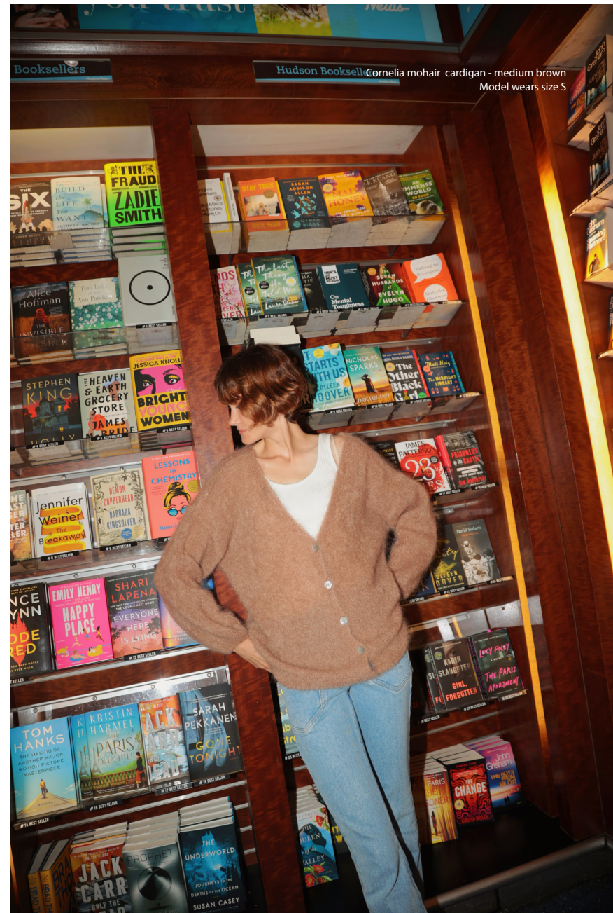
Booksellers Hudson Booksell Cornelia mohair cardigan - medium brown Model wears size S