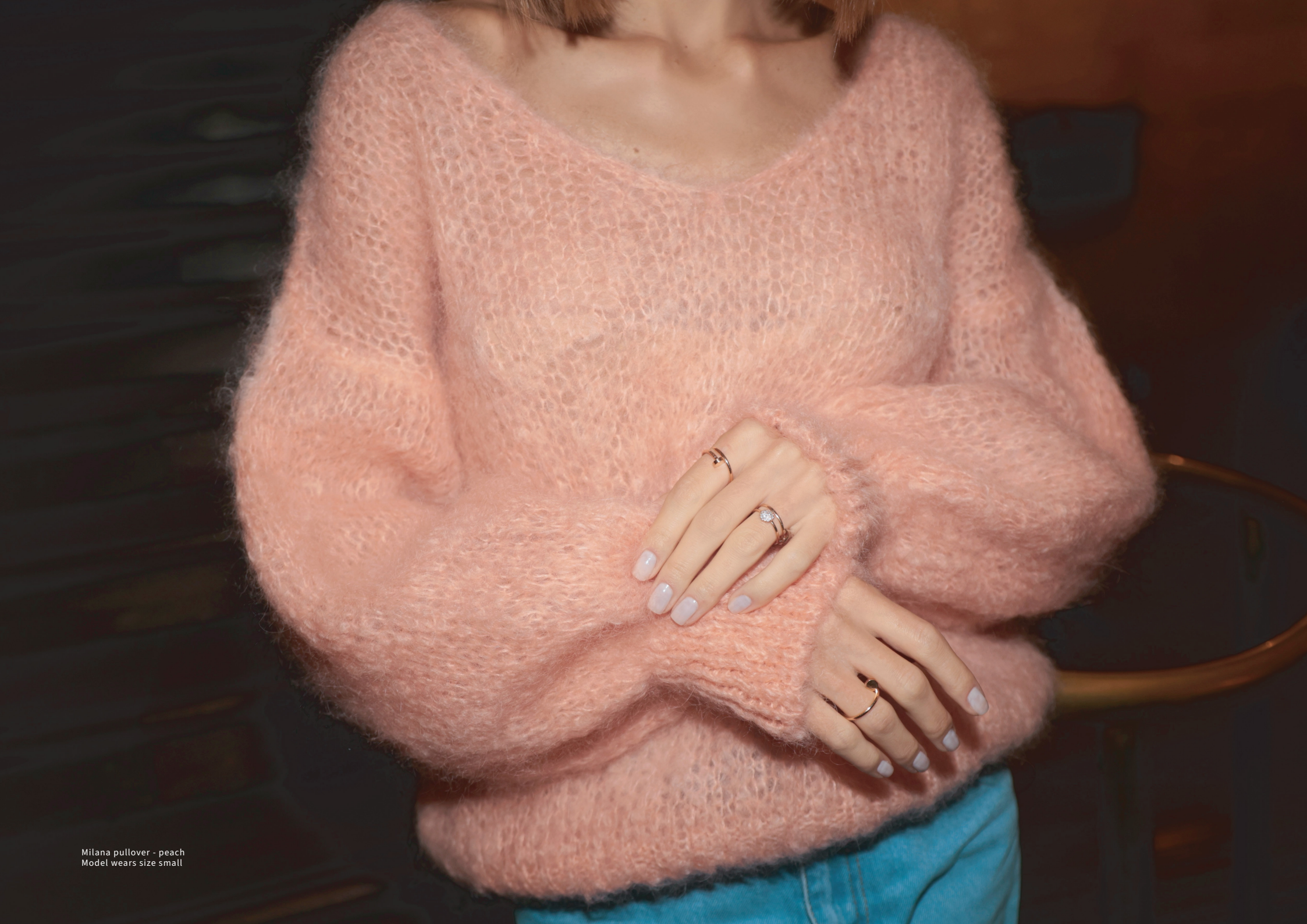
Milana pullover - peach Model wears size small