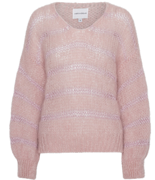
Light Pink W/ Light Pink Lurex