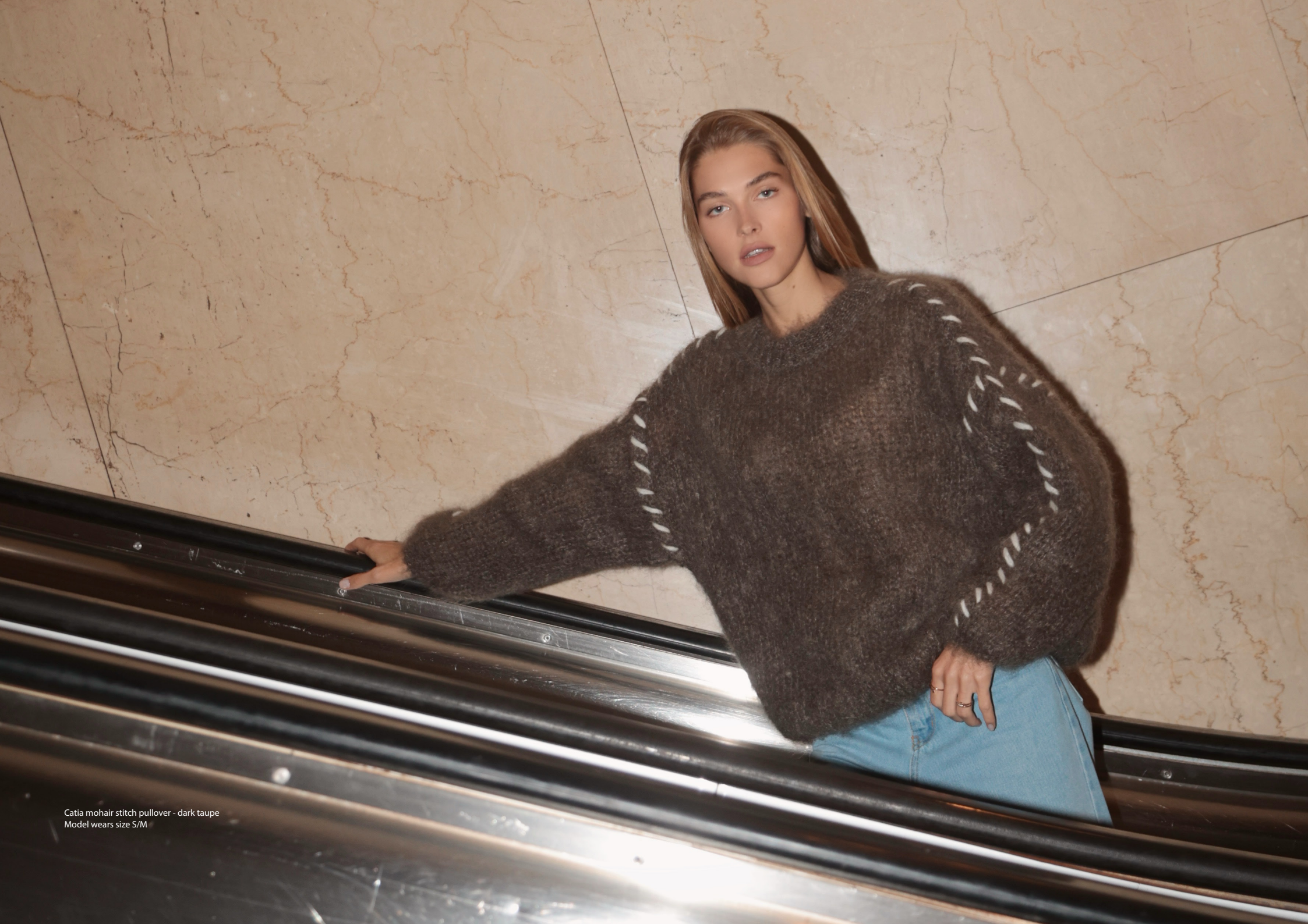
Catia mohair stitch pullover - dark taupe Model wears size S/M