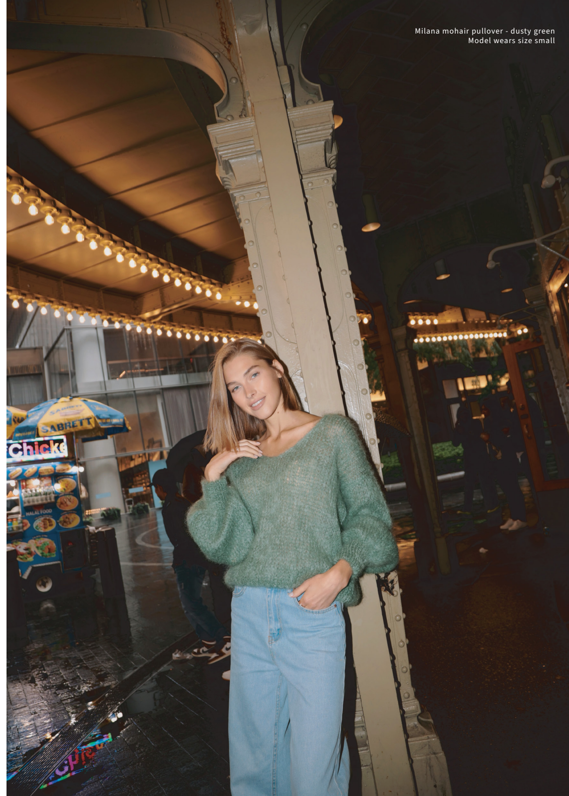
Milana mohair pullover - dusty green Model wears size small