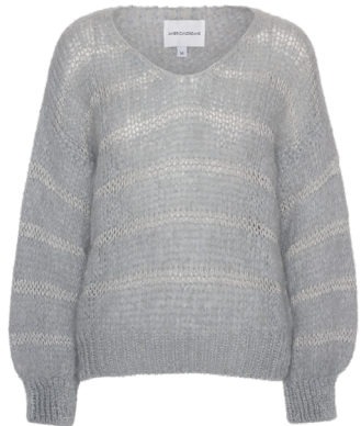
Light Grey W/ Light Grey Lurex