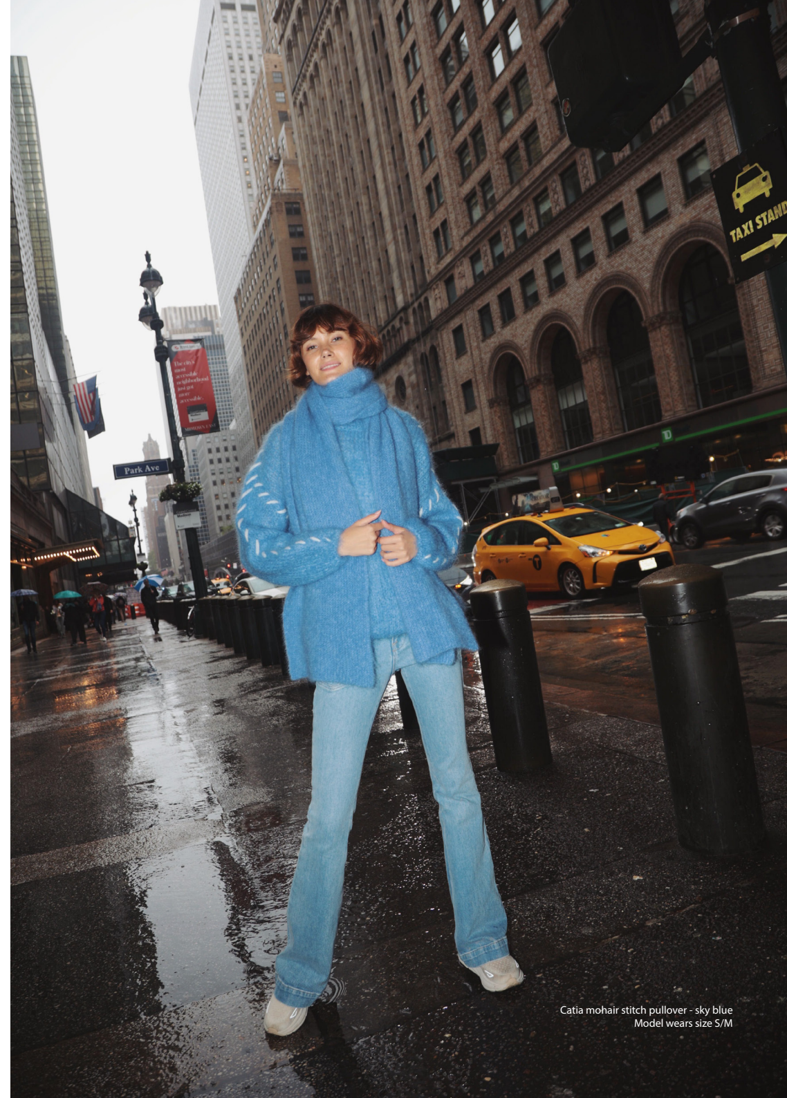
Catia mohair stitch pullover - sky blue Model wears size S/M