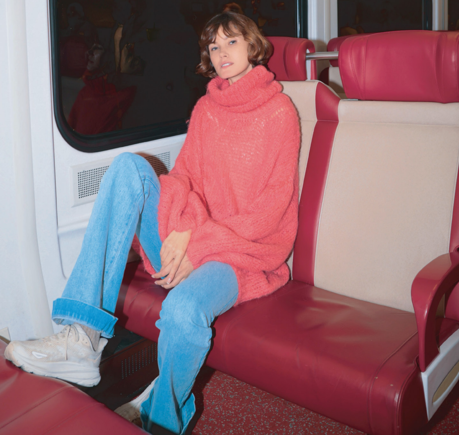
Pepper pullover - coral red Model wears one size