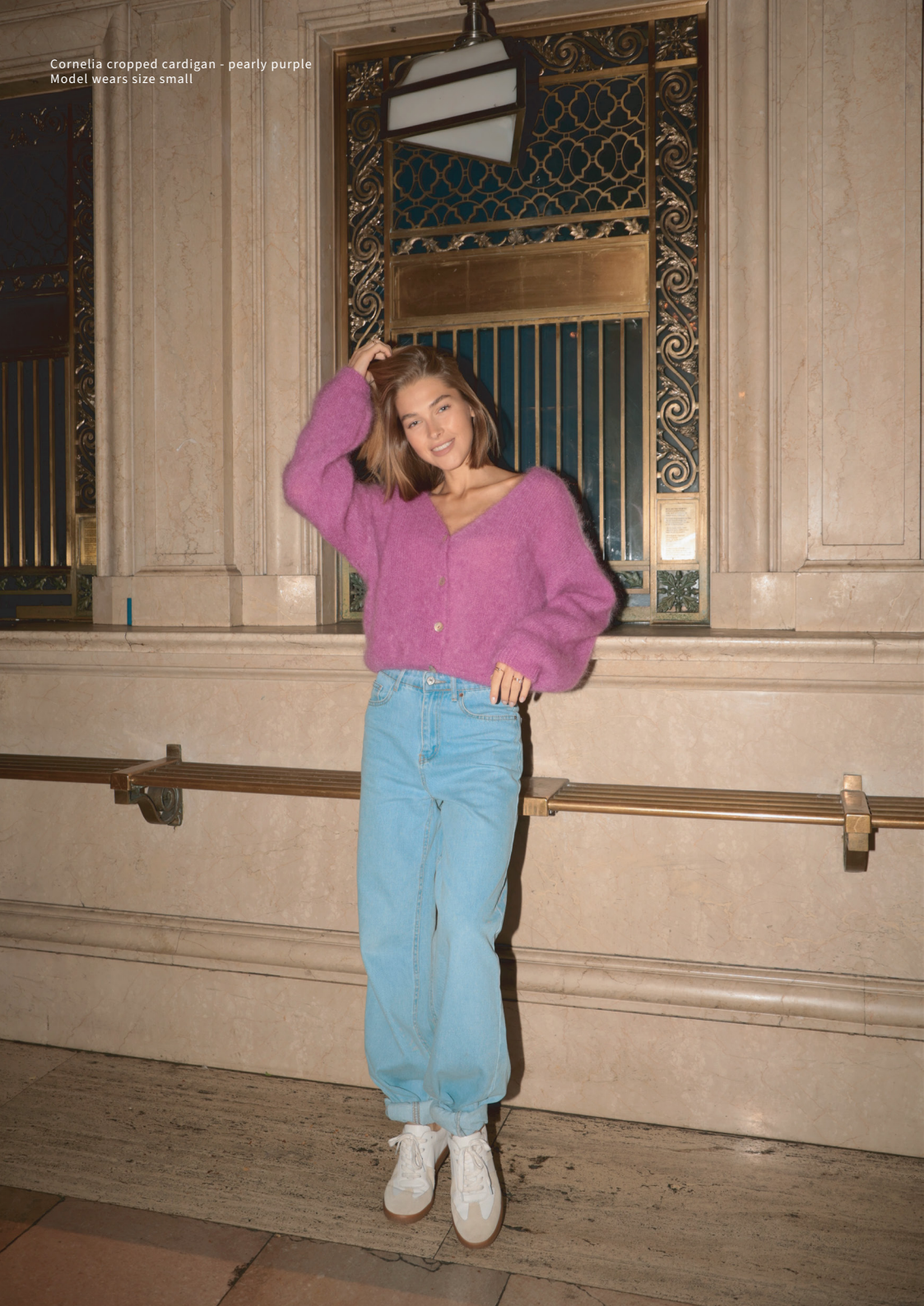
Cornelia cropped cardigan - pearly purple Model wears size small