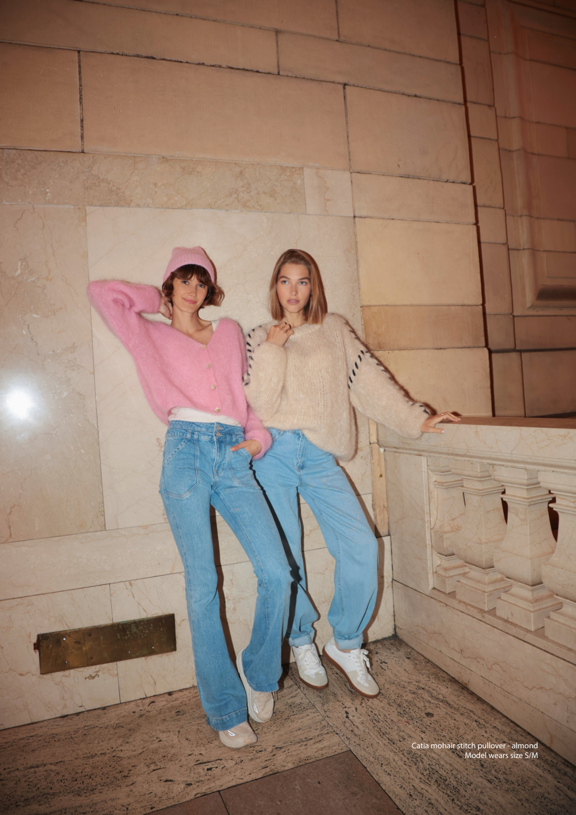
Catia mohair stitch pullover - almond Model wears size S/M