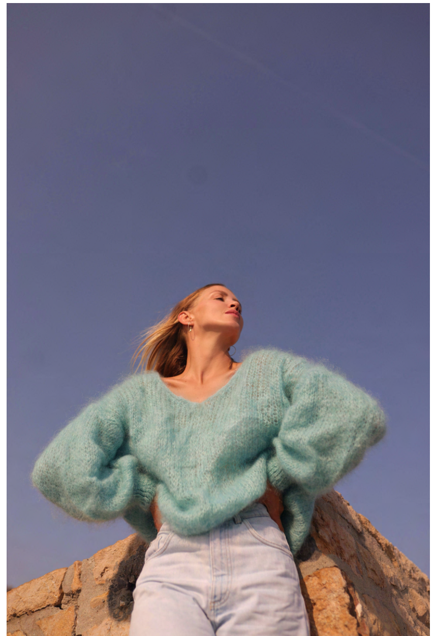
Milana LS Mohair Knit - Seafoam Green and Bright Green Models wear size m