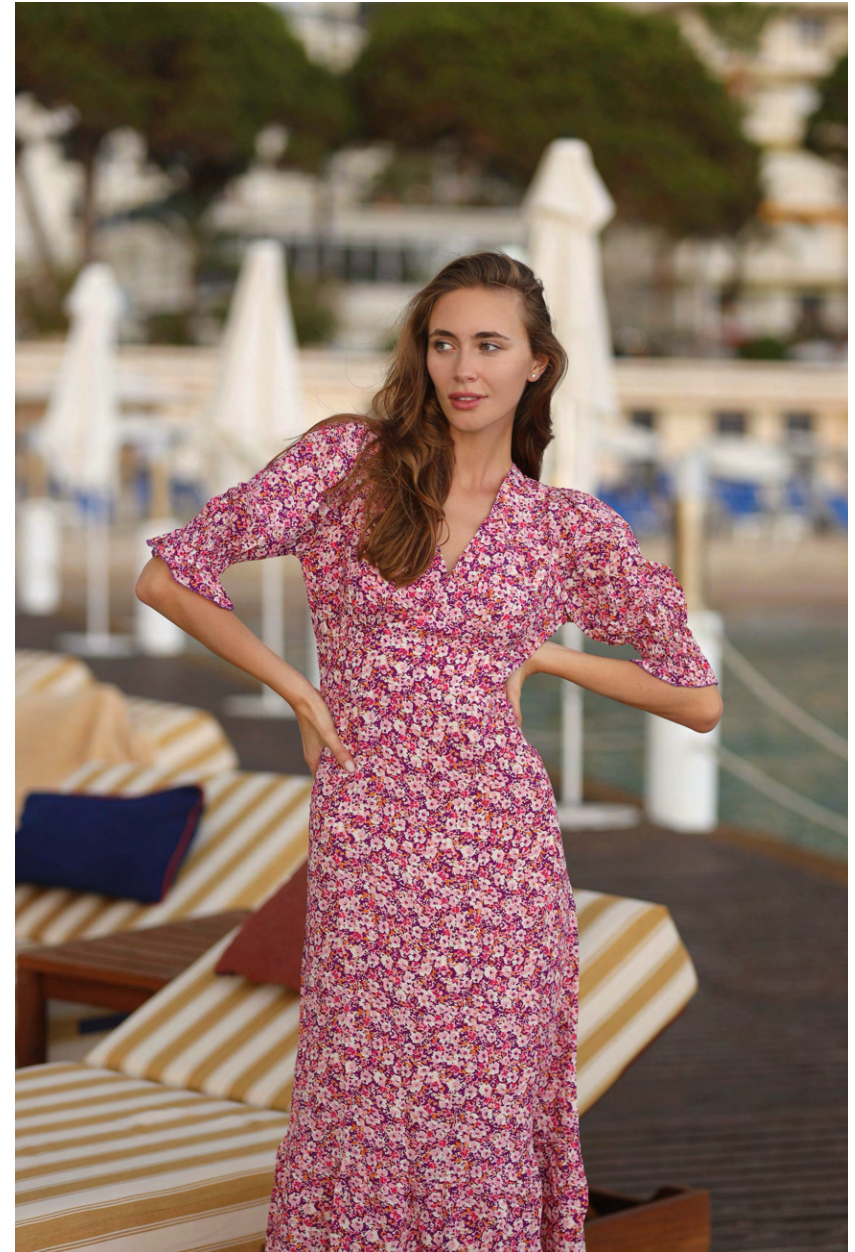
Koko Dress Long - Lilac Flower Model wears size small