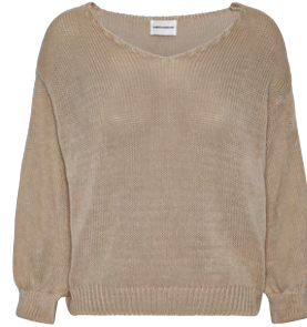
Medium Brown Lilac

Milana Light Cotton Pullover 100% Cotton Made in Italy S-XL