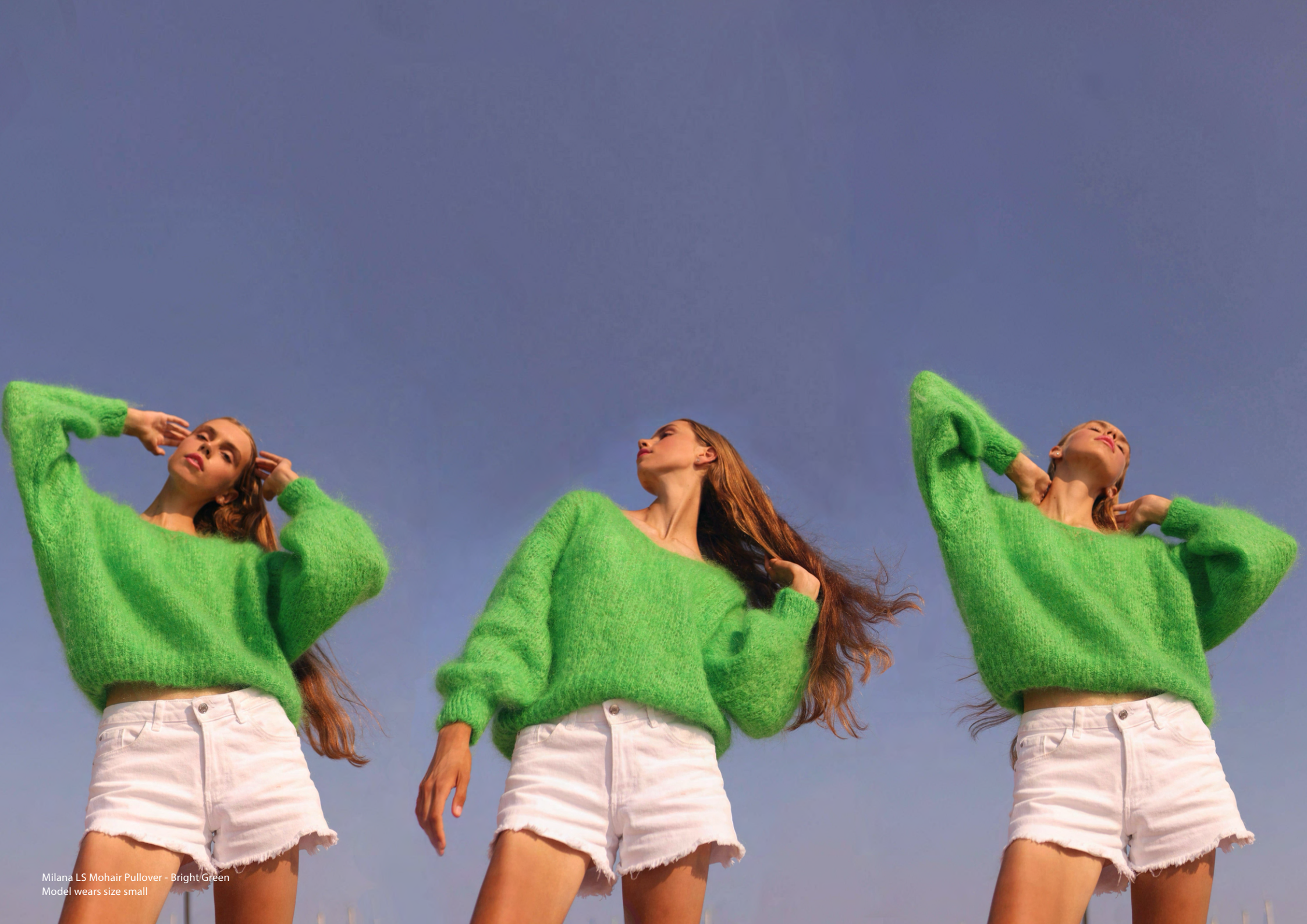
Milana LS Mohair Pullover - Bright Green Model wears size small