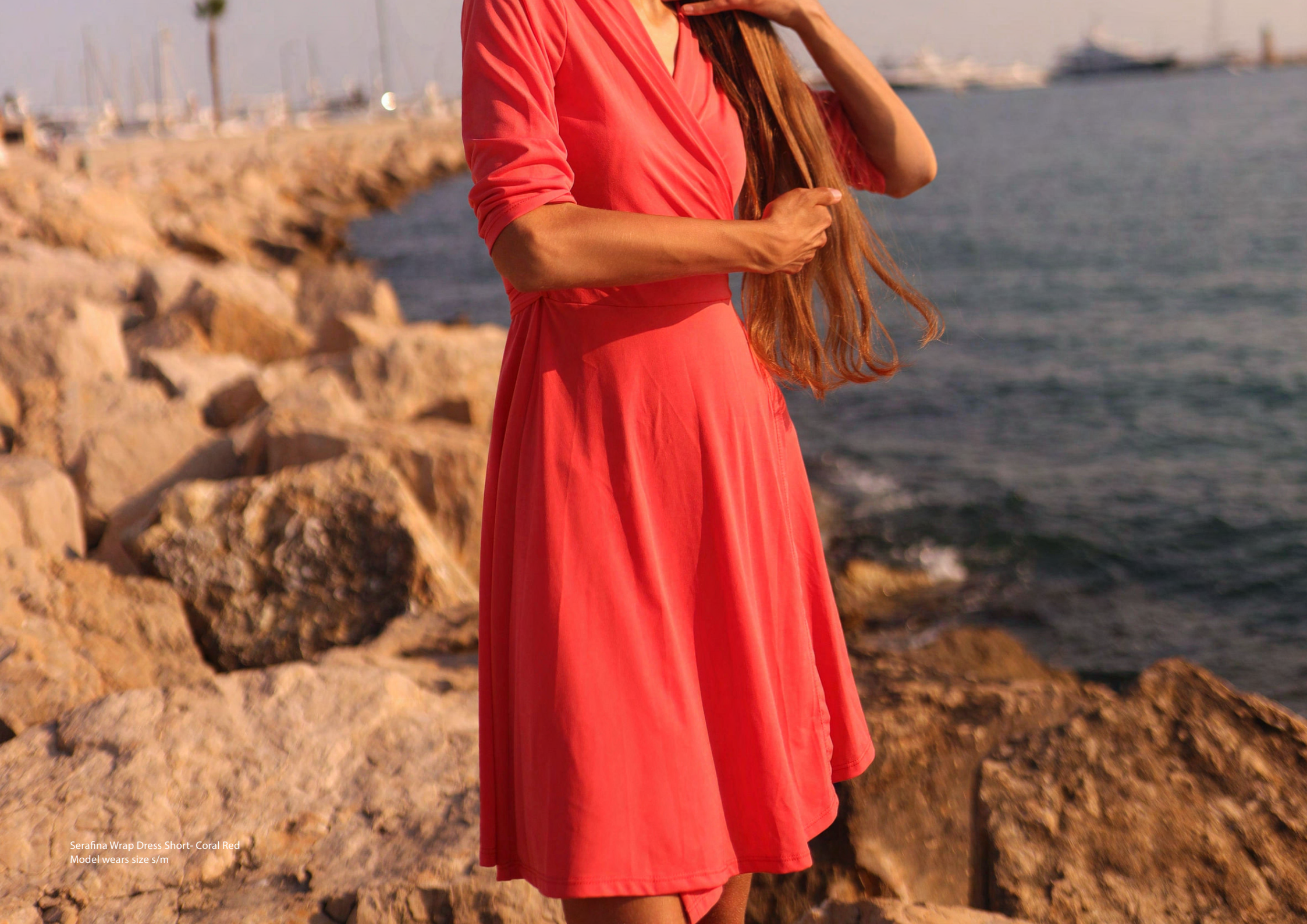
Serafina Wrap Dress Short- Coral Red Model wears size s/m