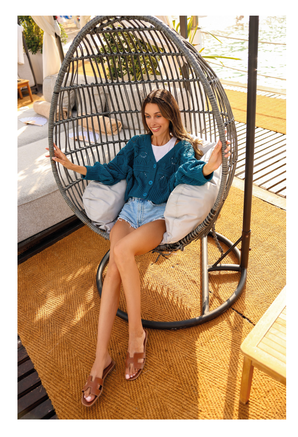
Riley Cotton Cardigan - Teal Blue Model wears size S